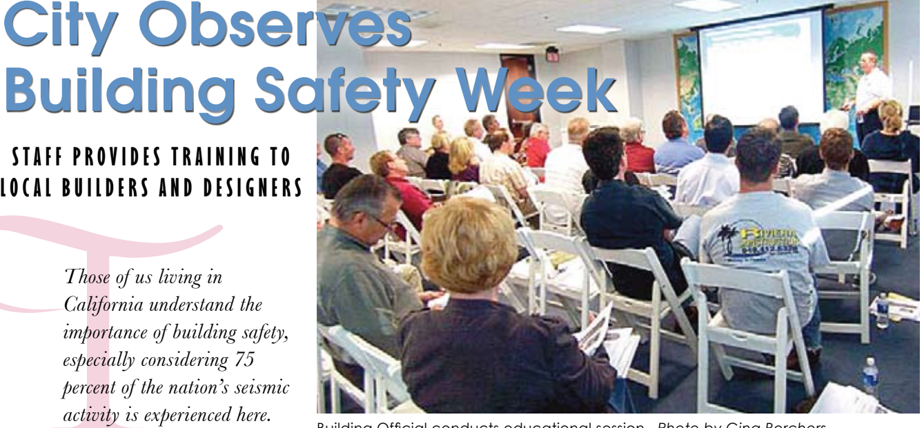
Building Official conducts educational session.

This year Building Safety Week 2008 is recognized from May 5th through the 11th with the theme "Building Safety: Where You Live, Work and Play." To help raise awareness of building safety, the City of San Clemente is celebrating Building Safety Week, joining communities across the nation to promote the use and understanding of build-