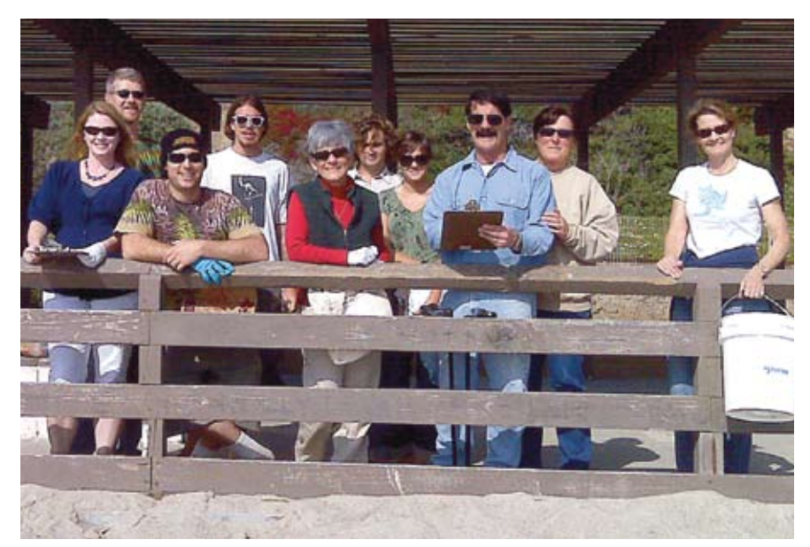
The members of the "Clean Team" on their first scheduled clean up for section #12 (T-street to Restrooms).

To ensure all of San Clemente's beaches remain healthy, the Watershed Task Force implemented an Adopta-Beach program in 2005. The late Stephanie Dorey spearheaded the program which runs the full length of the San Clemente Beach Trail and is divided into 22 different sections of beach. The Adopta-Beach program supports the Watershed Taskforce mission statement: to provide a healthy ocean/beach environment in San Clemente, by developing a community-wide effort to improve the quality of our local waters.