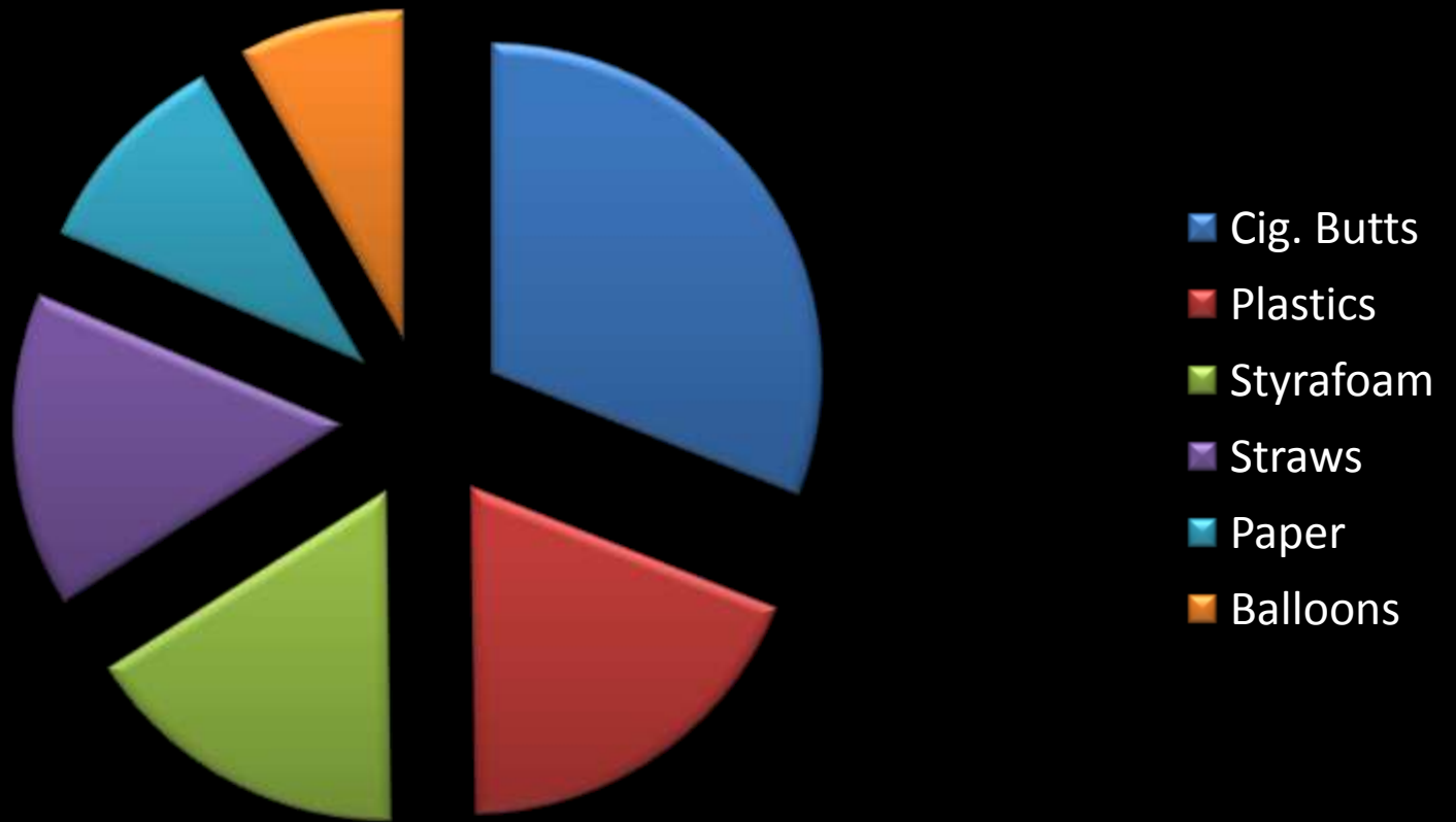
Trash Removed by Adopt a Beach Teams